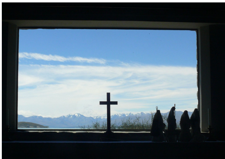
A view from the Church of the Good Shepherd, Tekepo New Zealand